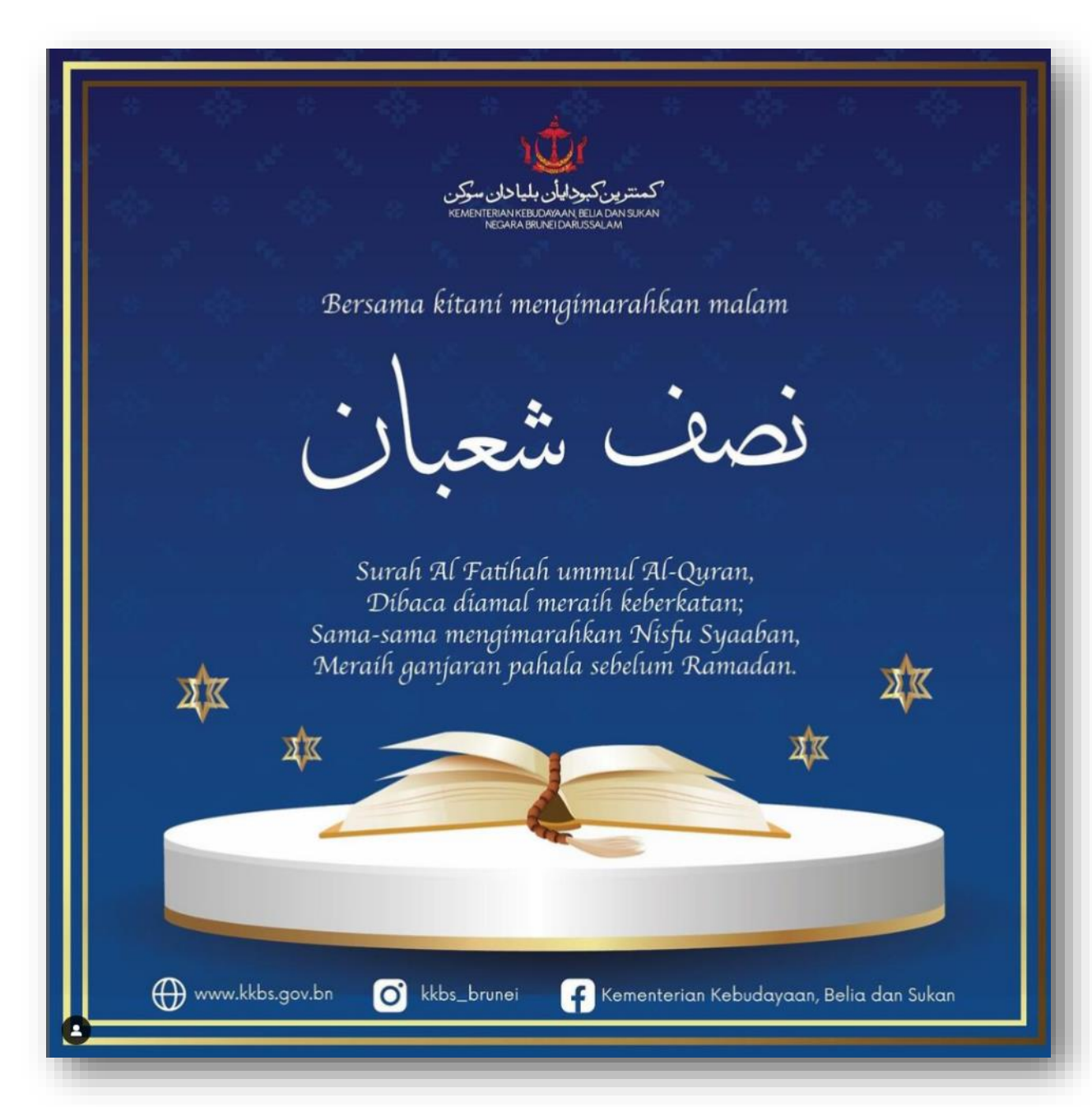
E-POSTER IN CONJUNCTION WITH CELEBRATION OF NISFU SYAABAN