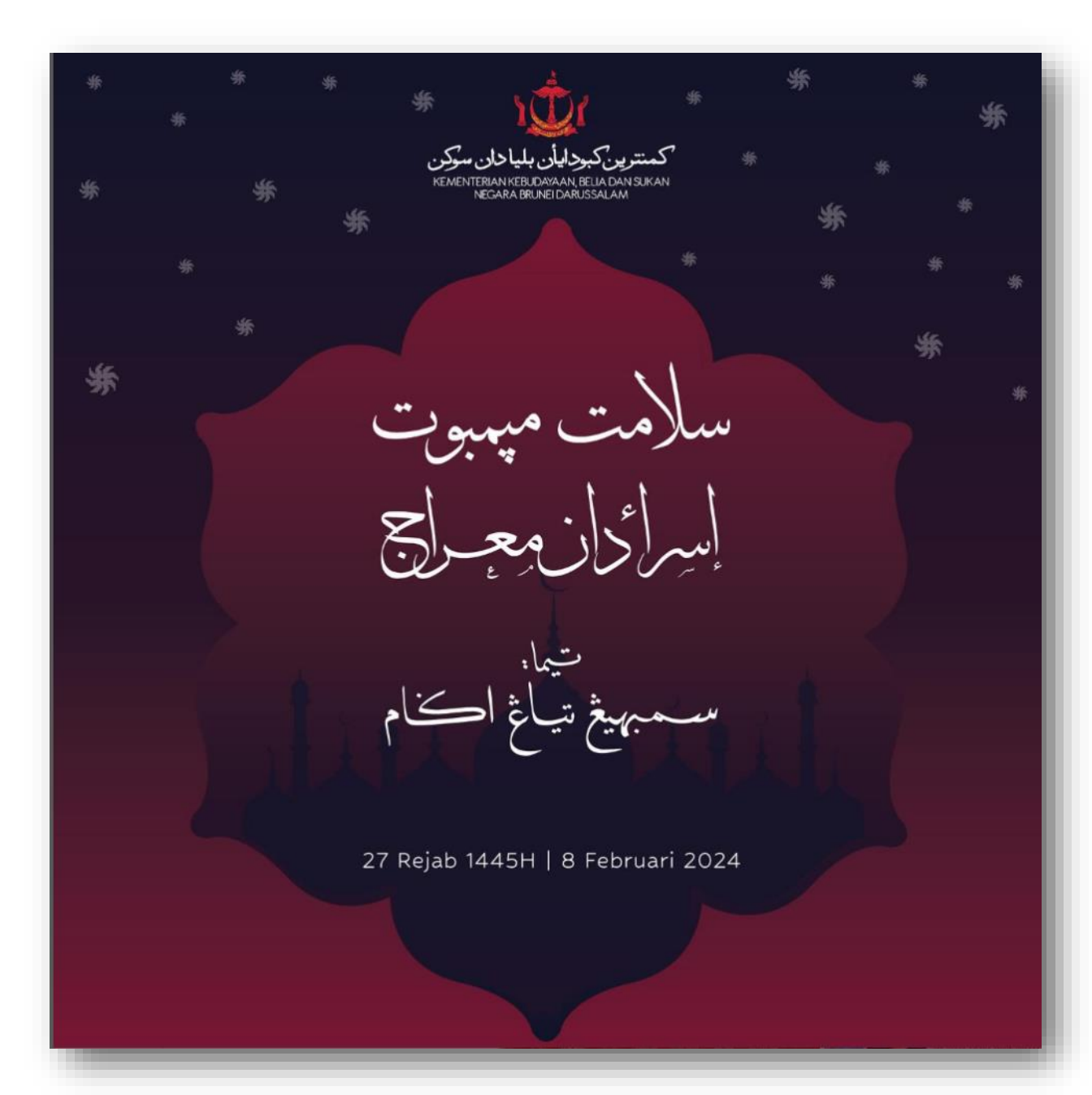
E-POSTER IN CONJUNCTION WITH REMEMBERING THE JOURNEY OF ISRA' AND MI'RAJ