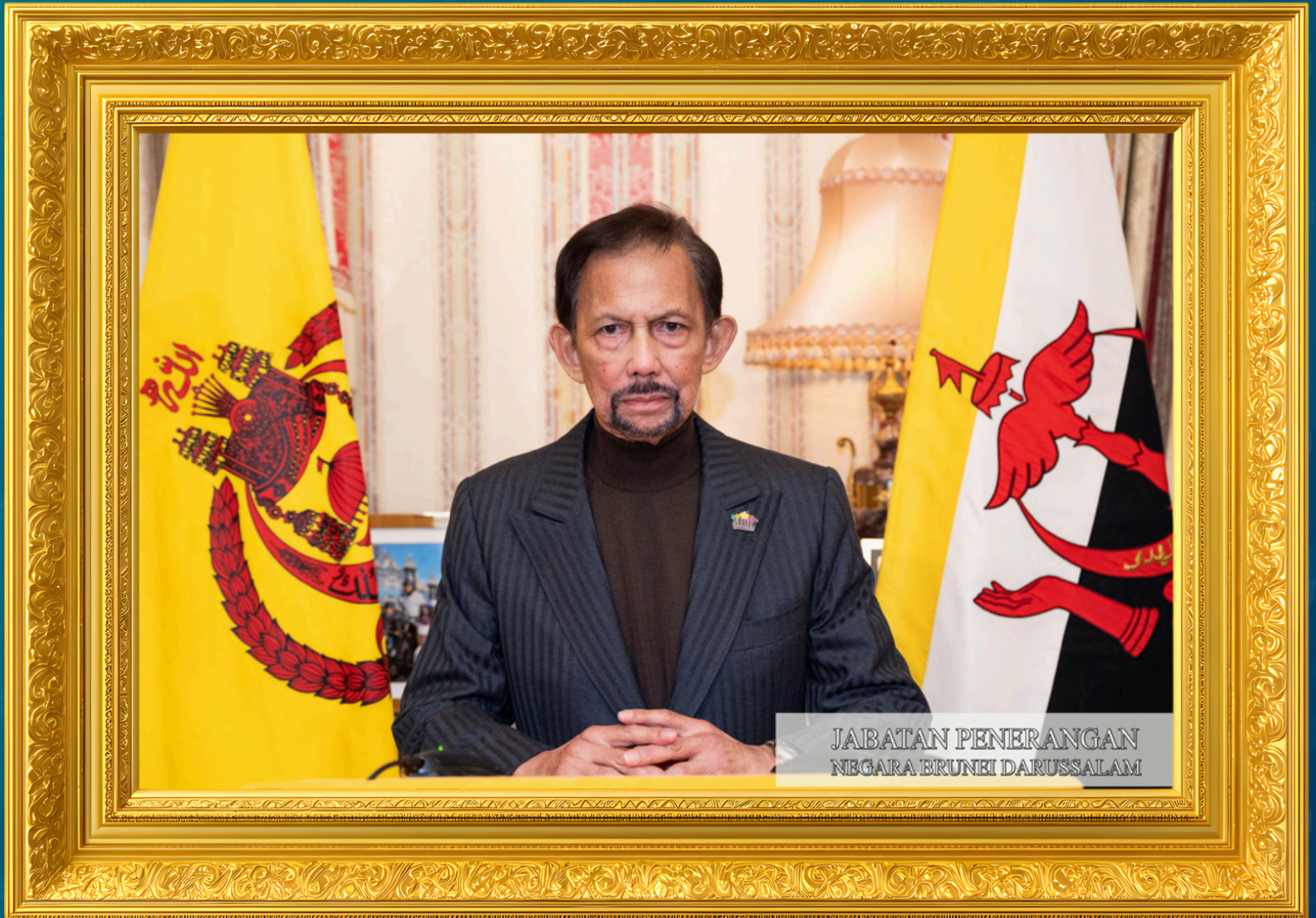
KEBAWAH DULI YANG MAHA MULIA PADUKA SERI BAGINDA SULTAN HAJI HASSANAL BOLKIAH MU'IZZADIN WADDAULAH IBNI AL-MARHUM SULTAN HAJI OMAR 'ALI SAIFUDDIN SA'ADUL KHAIRI WADDIN, SULTAN DAN YANG DI-PERTUAN NEGARA BRUNEI DARUSSALAM