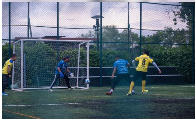
PERLAWANAN FUTSAL PERSAHABATAN BERSEMPENA ULANG TAHUN KE-40 HUBUNGAN DIPLOMATIK NEGARA BRUNEI DARUSSALAM DAN MALAYSIA

Khamis, 02 Mei 2024 di Gelanggang Futsal, Suruhanjaya Tinggi Malaysia di Negara Brunei Darussalam