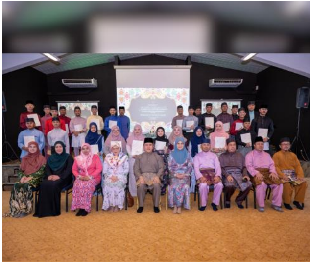
MUSABAQAH TILAWATIL QURAN BELIA KEBANGSAAN 1445/2024 PERINGKAT SEPARUH AKHIR

Ahad, 19 Mei 2024 di Dewan Silaturrahim, Pusat Belia, BSB