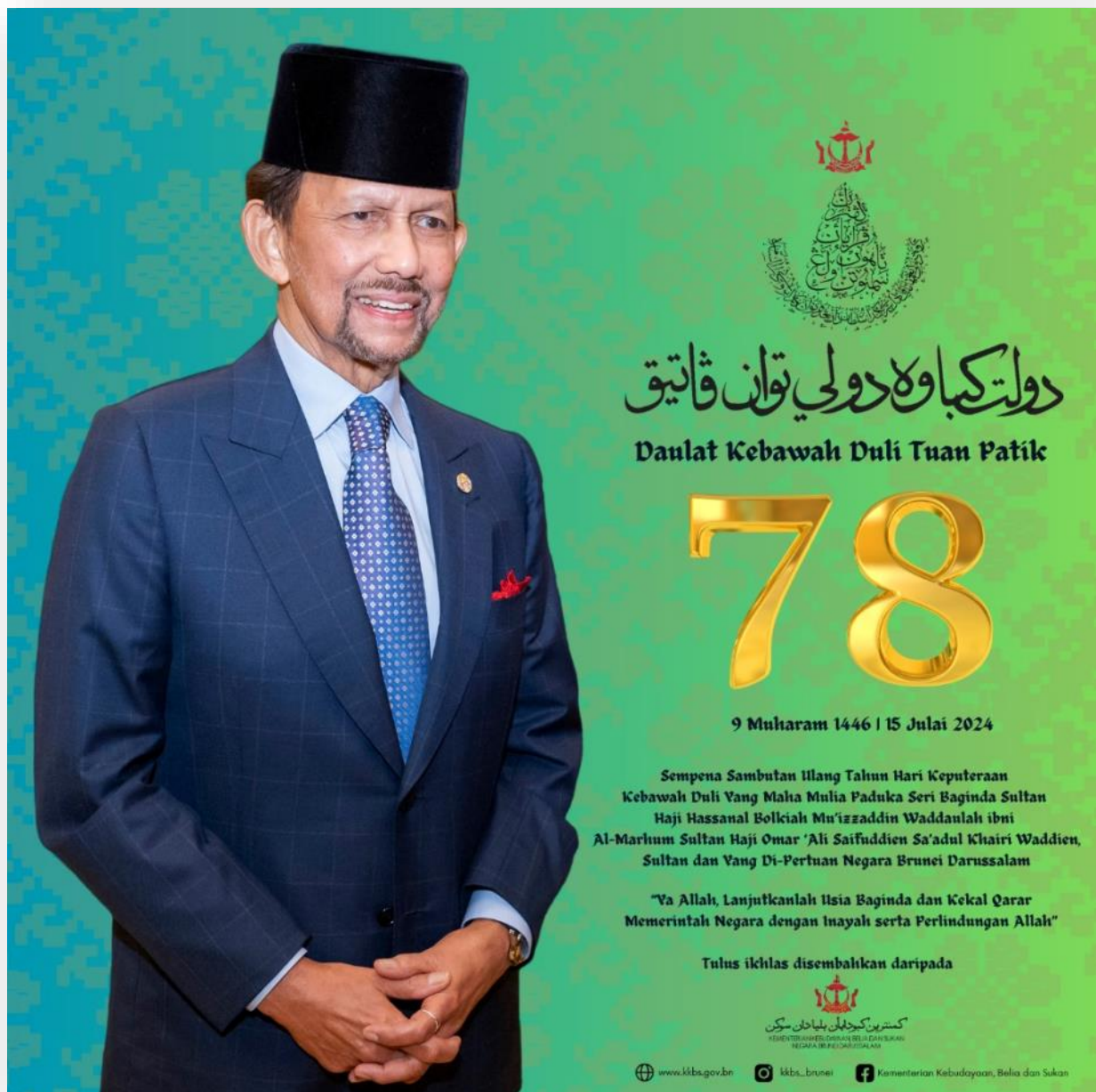
E-POSTER IN CONJUNCTION WITH HIS MAJESTY'S 78TH BIRTHDAY